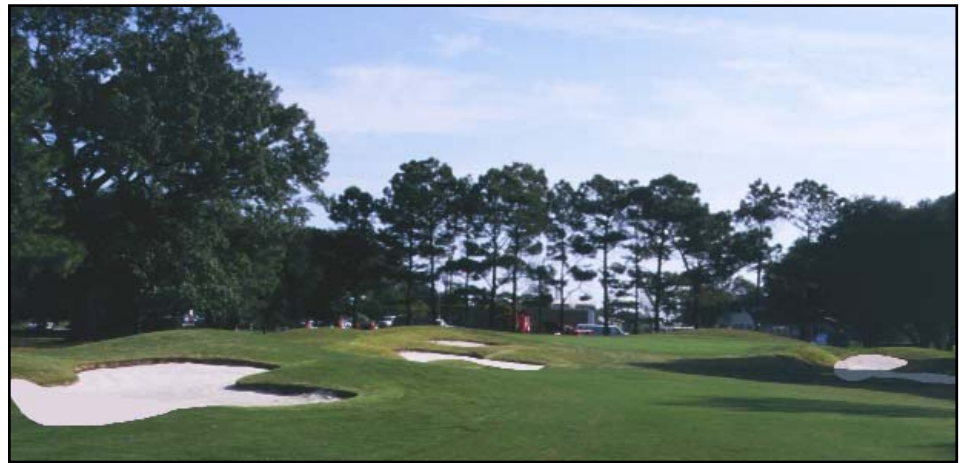
Hole No. 9 after construction.

20 lucky junior players, while nearby, another 150 juniors will receive instruction from local PGA and LPGA pros. Afterwards, Woods will present an exhibition for about 4,000 people, mostly junior golfers and their parents. Tiger's dad, Earl, will speak with parents about nurturing youth.