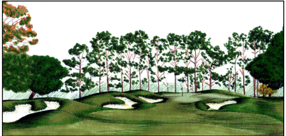
Golfplan's vision of the new hole No. 9.

During the clinic, Woods will give one-on-one instruction to a group of